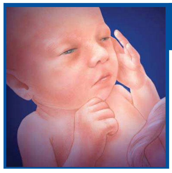
28 WEEKS (30 WEEKS AFTER THE FIRST DAY OF THE LAST NORMAL MENSTRUAL PERIOD)