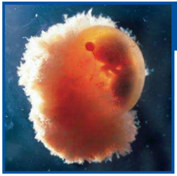
8 WEEKS (10 WEEKS AFTER THE FIRST DAY OF THE LAST NORMAL MENSTRUAL PERIOD)