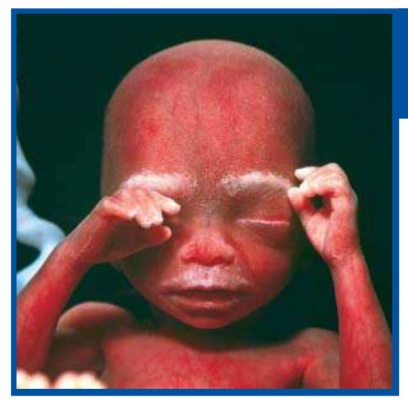
20 WEEKS (22 WEEKS AFTER THE FIRST DAY OF THE LAST NORMAL MENSTRUAL PERIOD)